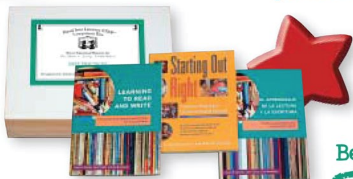
Best Practices Kit