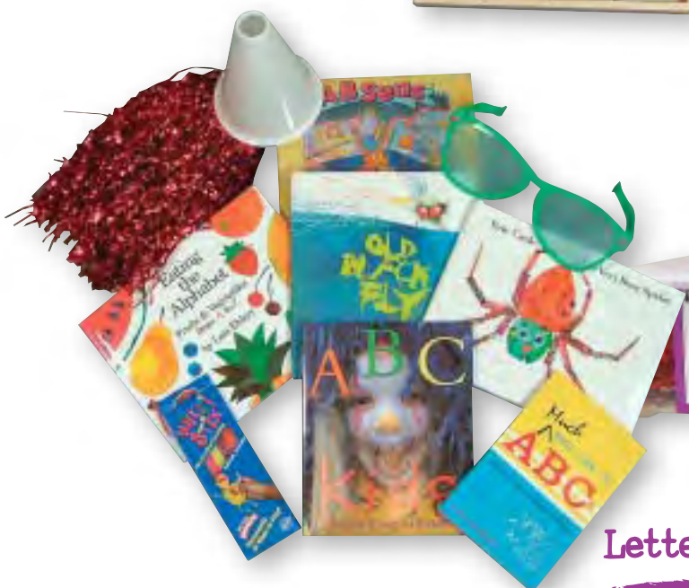
Letter Knowledge Kit