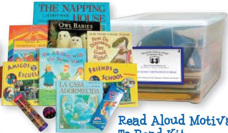
Read Aloud Motivation To Read Kit

Featuring, Puppets With a Purpose™ Lizzie The Letter Lizard™ Rebecca The Rhyming Raccoon™ Vinny The Vocabulary Vulture™ Wally The Word Walrus™