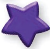
Print and Book Awareness