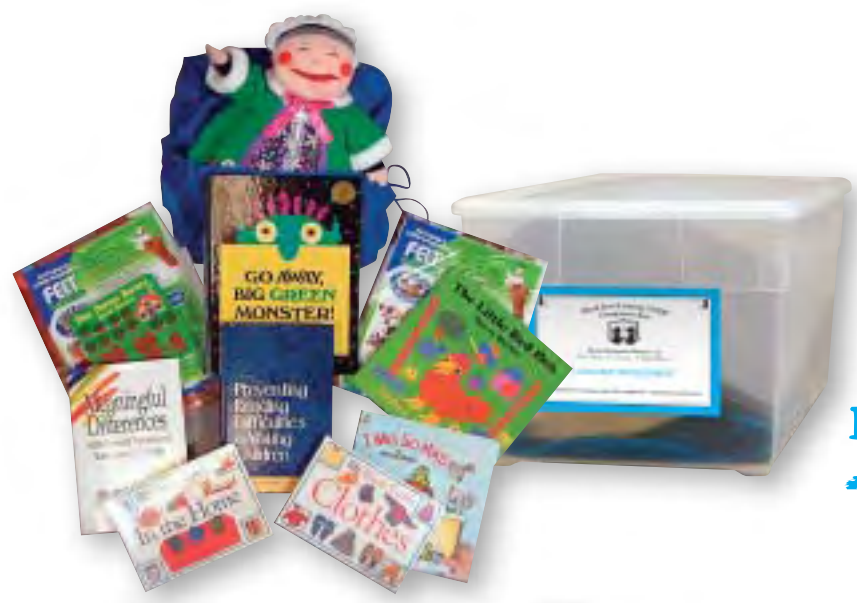
Language Development Kit