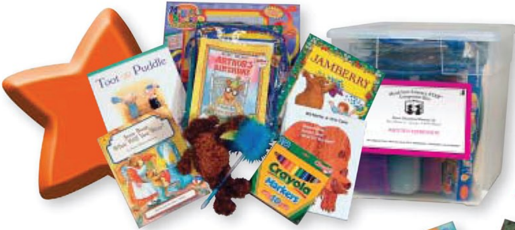
Written Expression Kit