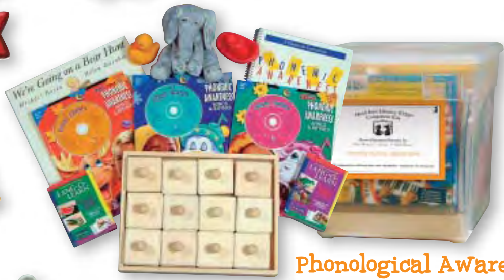
Phonological Awareness Kit